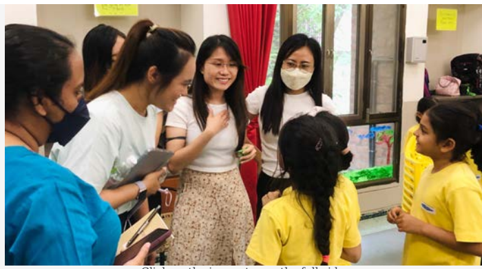
Click on the image to see the full video

Two teams from Kindity, Malaysia, each immersed in a five-day training at Riverside School. One group revisited Key Stage 1 (early years) processes and practices and were onboarded on the learning standards of Program of Inquiry, Logical Mathematical Thinking, and Language beacons to create their own. The other group had extensive discussions, observations and hands-on experience on the key strategies for Time-tabling that they can implement in their school.